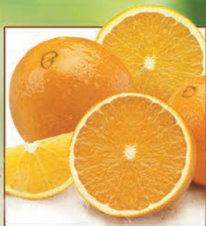
December Navel Oranges