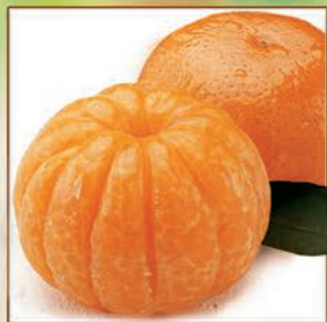
November Mandarin Oranges

Always have delicious, fresh citrus in your home, ripe and ready to enjoy. Choose a 2, 4, or 6 month plan and select the amount of fruit you wish to receive. A fresh variety will arrive every month!