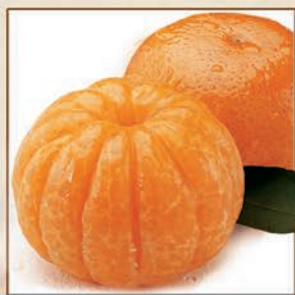
March Mandarin Oranges