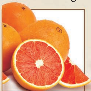
February Scarlet Navels