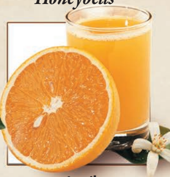
April Valencia Oranges