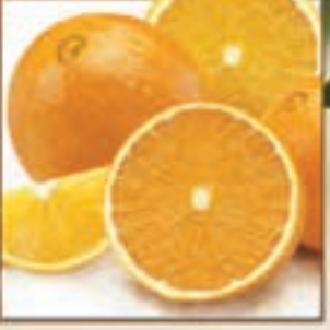
December Golden Navels